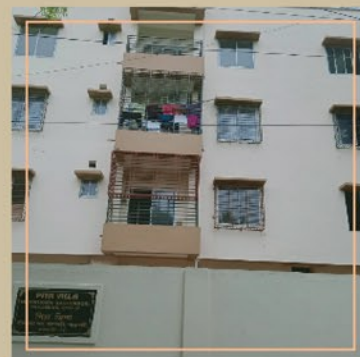
PIYA VILLA Baghorbari, Guwahati