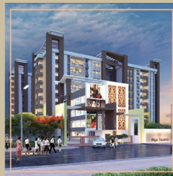
PIYA TOWERS Radhanagar, Guwahati