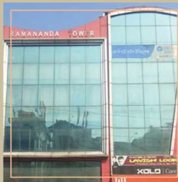
RAMANANDA TOWER Paltan Bazar, Guwahati