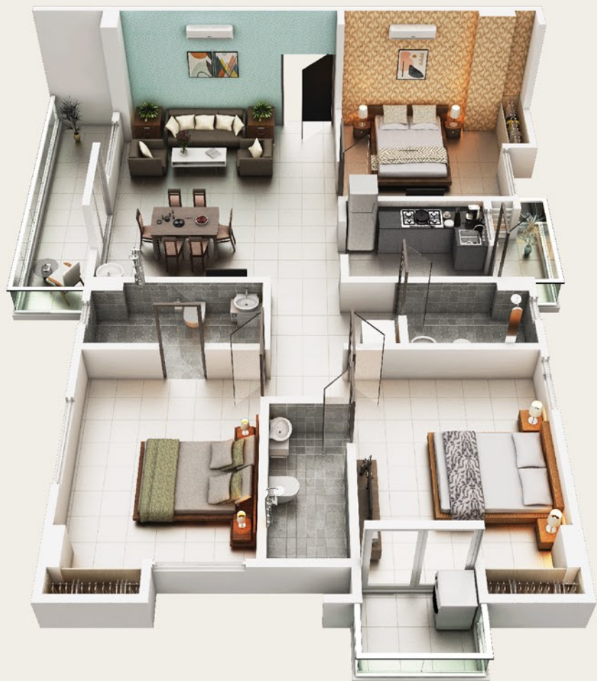
BLOCK - A TYPICAL 1ST TO 14TH FLOOR