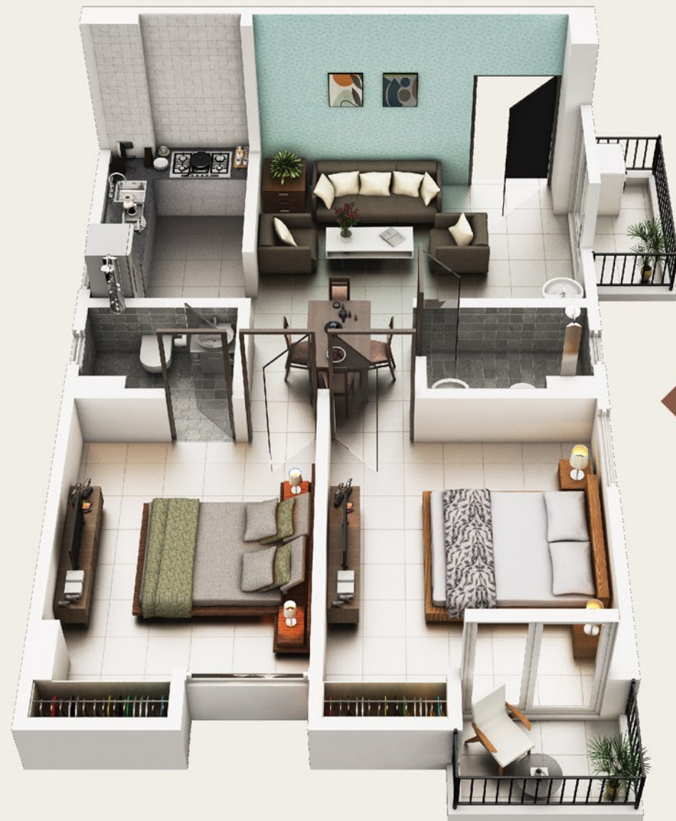
BLOCK - D TYPICAL 1ST TO 14TH FLOOR