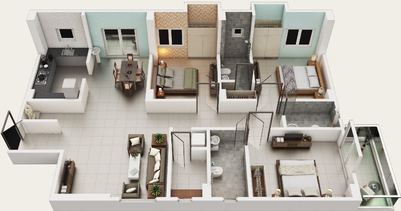
BLOCK - E TYPICAL 1ST TO 14TH FLOOR