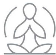
YOGA AND MEDITATION AREA