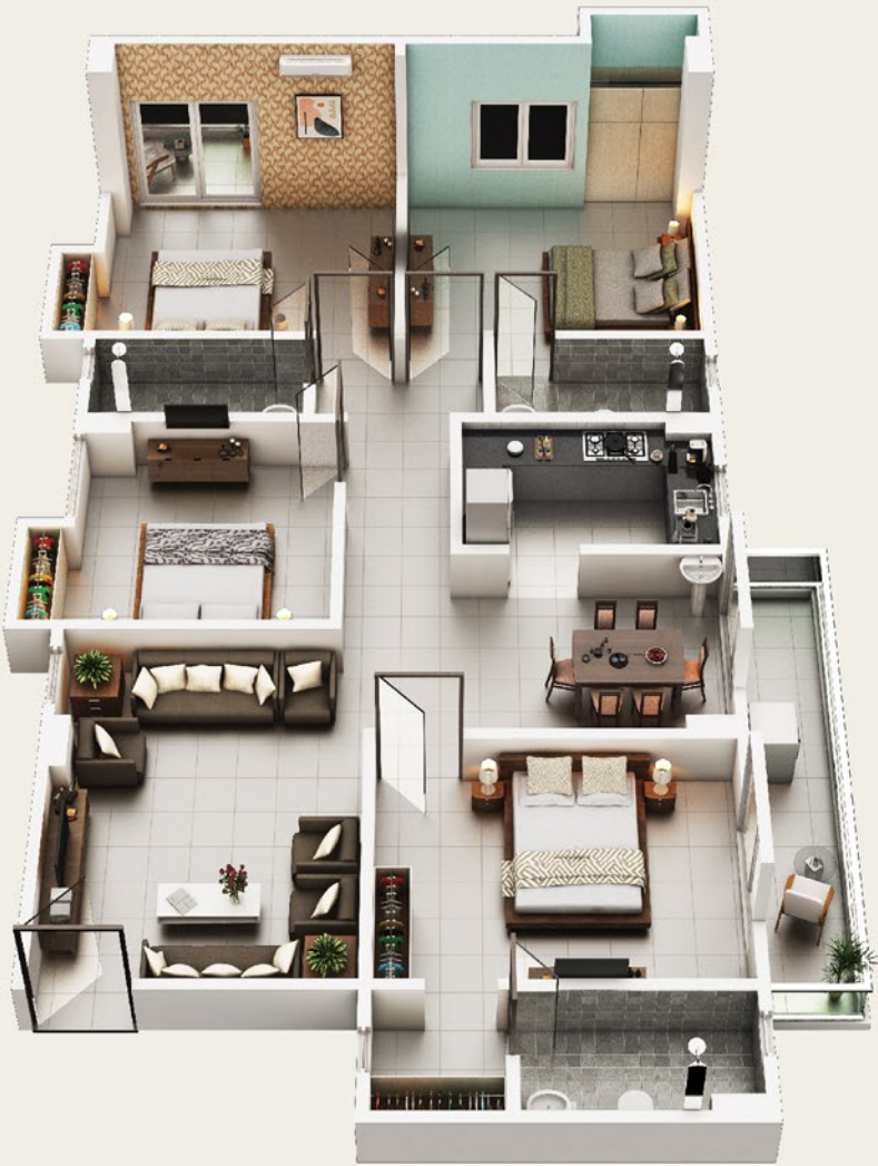
BLOCK - A TYPICAL 1ST TO 14TH FLOOR