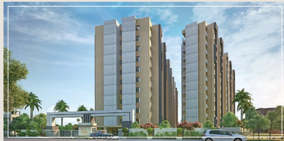
PIYA HILL VIEW Gotanagar, Guwahati