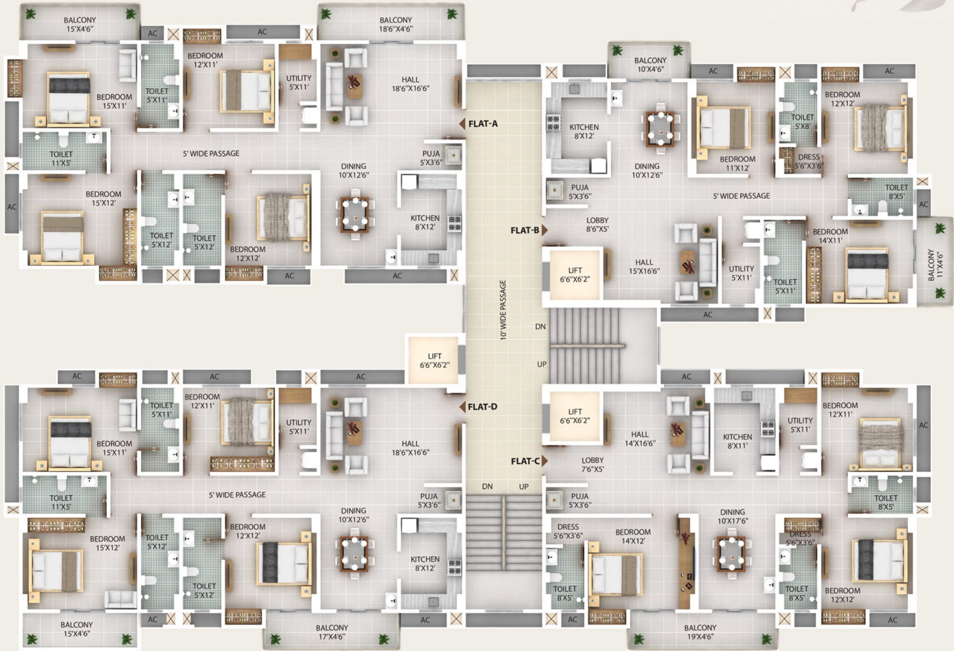
BLOCK - E TYPICAL 1ST TO 14TH FLOOR