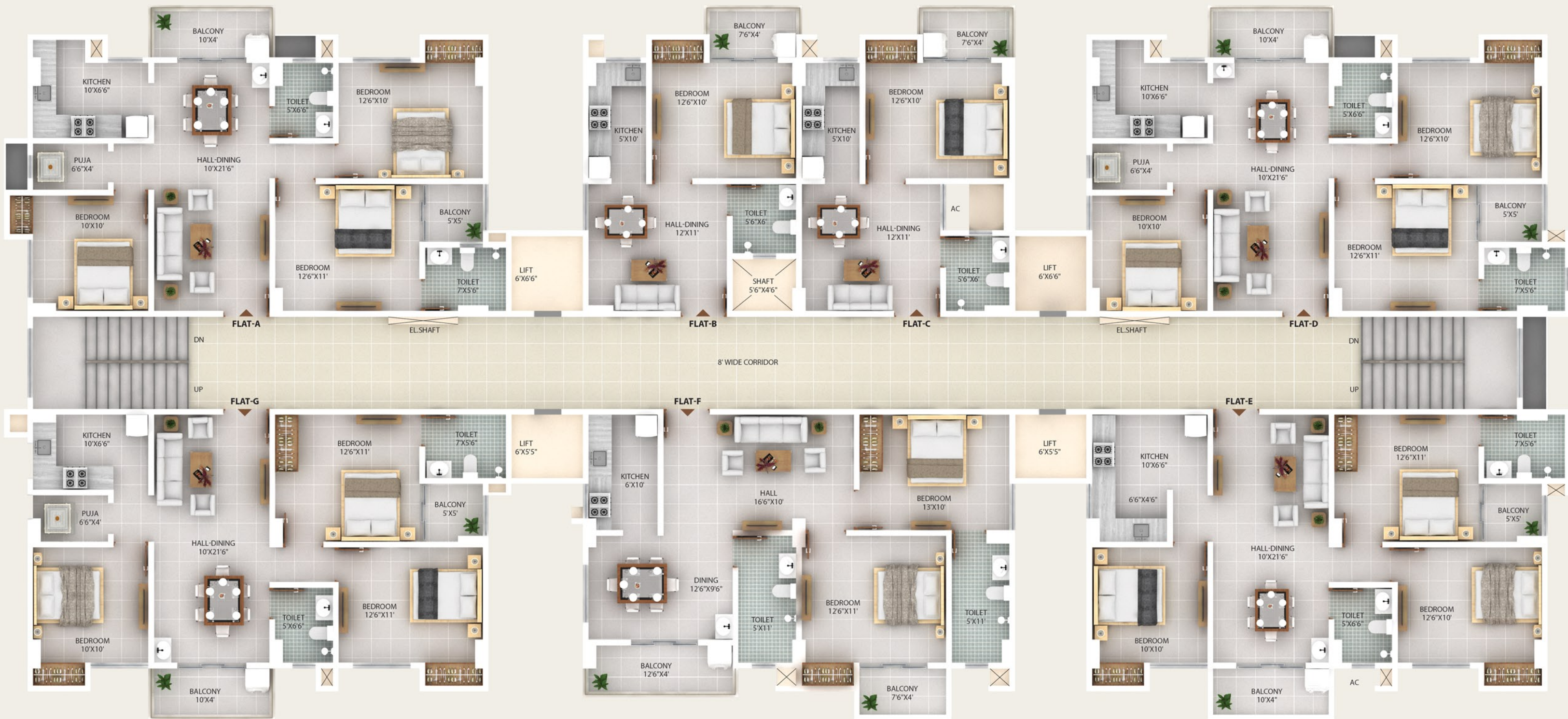
BLOCK - B & C TYPICAL 1ST TO 11TH FLOOR