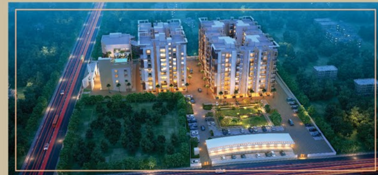
PIYA EXOTICA Kahilipara, Guwahati