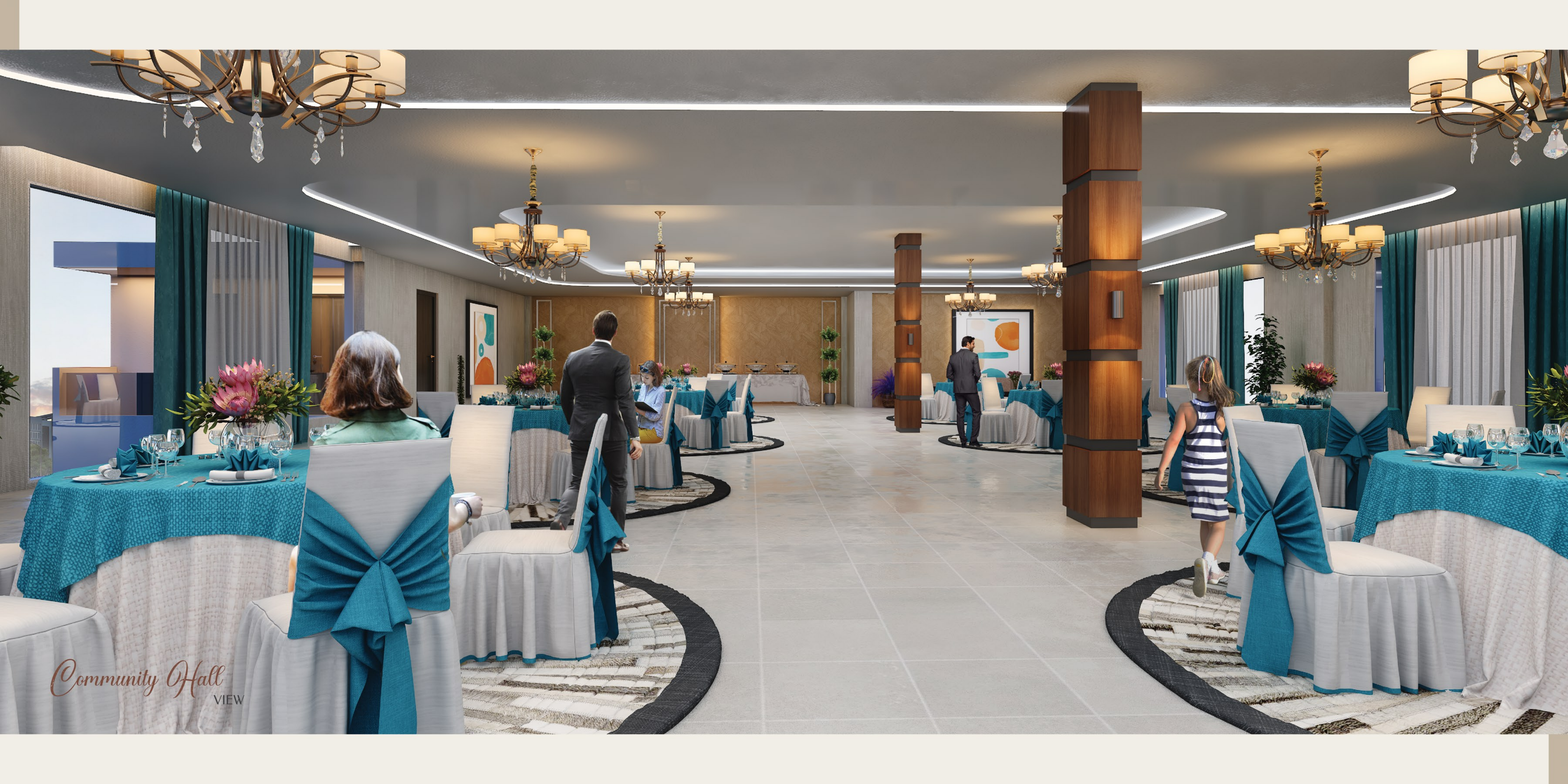
Community Hall VIEW