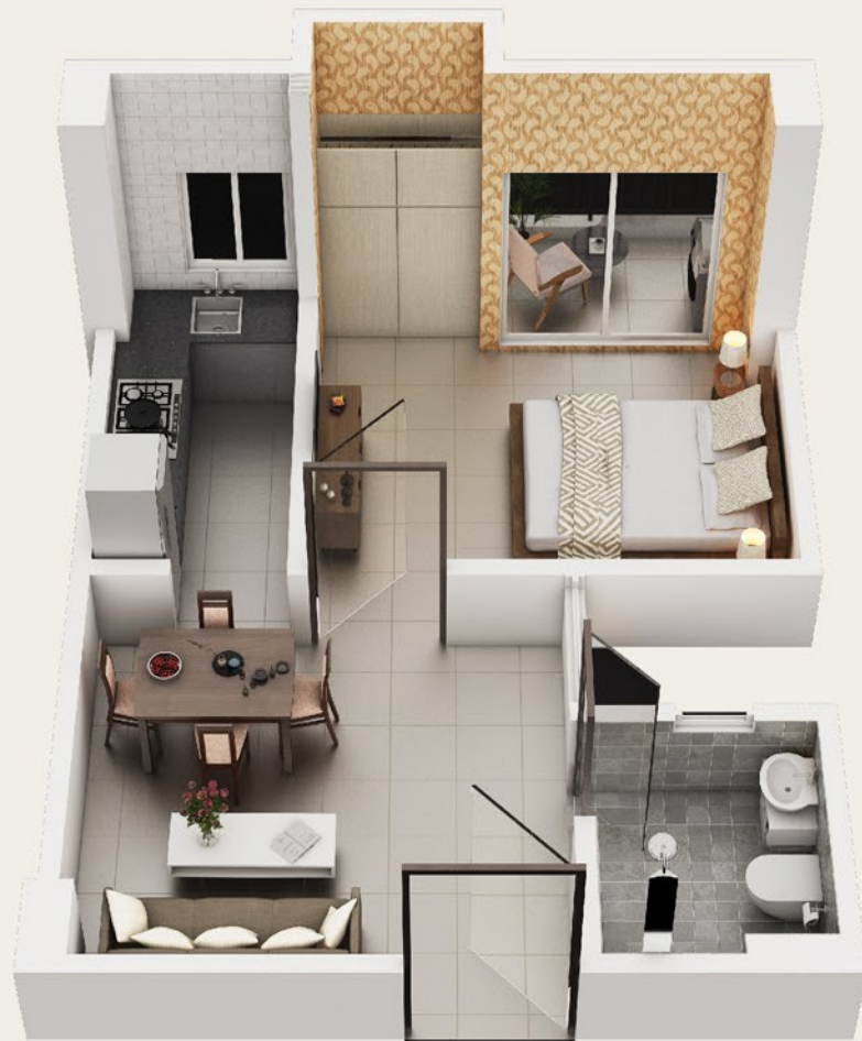
BLOCK - B & C TYPICAL 1ST TO 11TH FLOOR