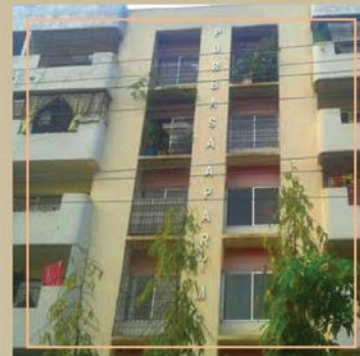
PURBASA APARTMENT Six Mile, Guwahati