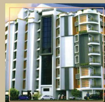
PIYA PLAZA Borbari Chowk