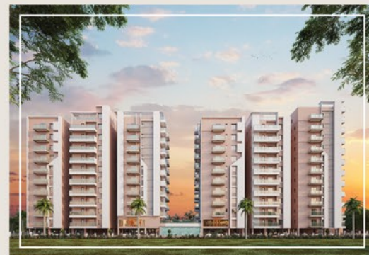
PIYA GREEN HILLS Pani Path, Guwahati