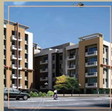
DIVYA APARTMENT Bhetapara, Guwahati