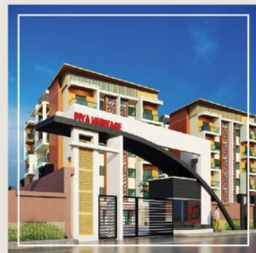
PIYA HERITAGE Jilika Path, Guwahati