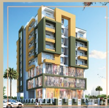
PIYA PLAZA 2 Guwahati