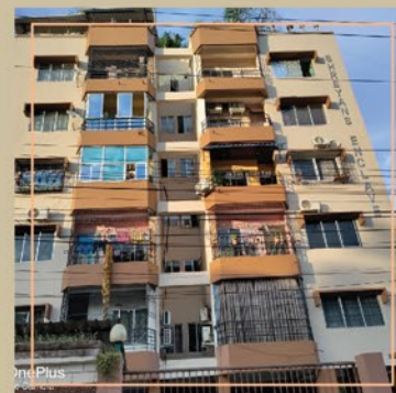
SHREYANS ENCLAVE Christian Basti, Guwahati