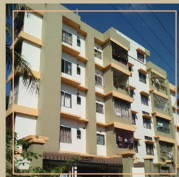
SARAT KUTIR Sarumotria, Guwahati