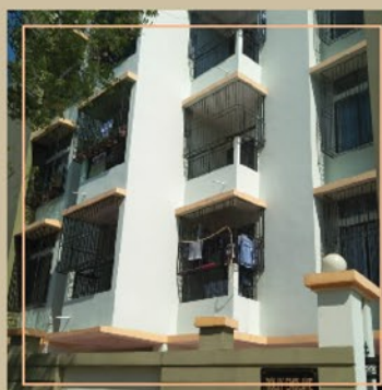
ROLLY ENCLAVE Jayanagar, Guwahati