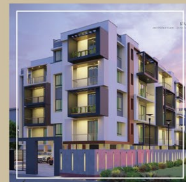
PIYA ENCLAVE Juripar, Guwahati