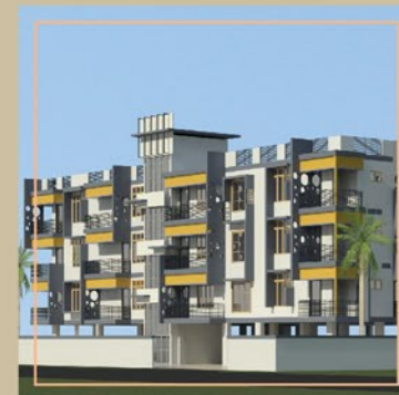
JYO'S PLAZA Last Gate, Guwahati