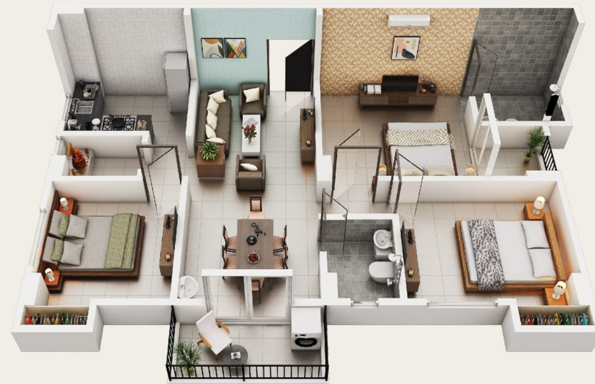
BLOCK - B & C TYPICAL 1ST TO 11TH FLOOR