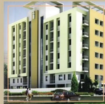
THE ANGEL Pathar Quarry, Guwahati